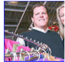
Growing like a weed edginess to baby fast

In addition, a Roth IRA has no minimum distribution. It's up to the investor when and how